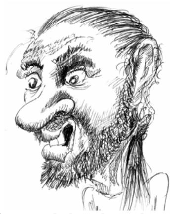
Geese yer dosh yer bastards

Anyway, well done for staying the course once more. It must be good to know that about you the trouble of calling meetings and writing circulars to justify your paid seaside holiday,